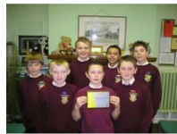
Table Tennis News